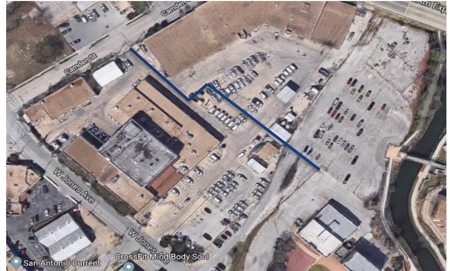
Jones Avenue Property