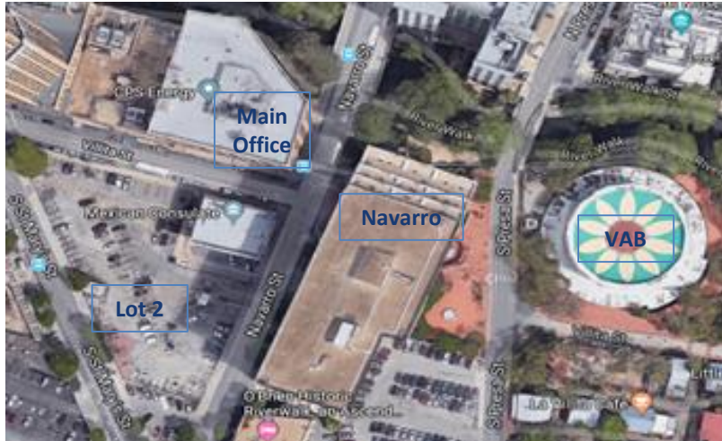
Downtown Campus & Villita Assembly Bldg. (VAB)