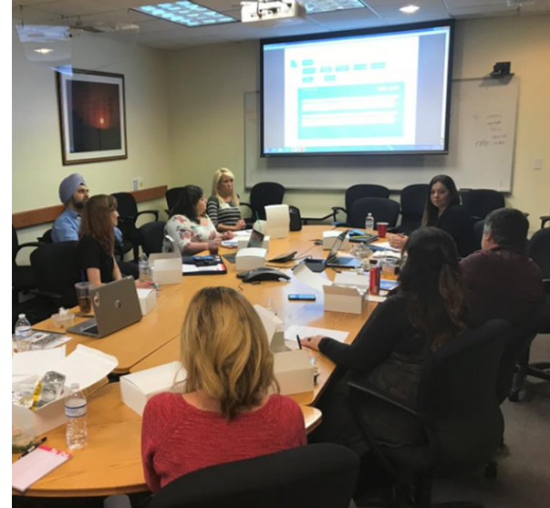
Solar installer feedback session on 2/20/19

Since December, 100% of solar applications are now being submitted electronically through the portal