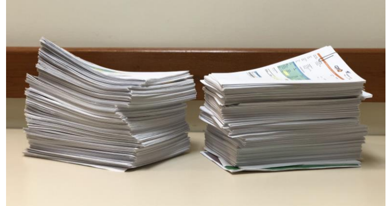
Illustration of paper used for 50 solar applications

Efficiency gains are meaningful as we receive 300-500 solar applications per month