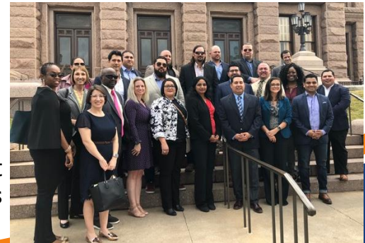
Emerging Leaders Cohort on West Capitol Steps