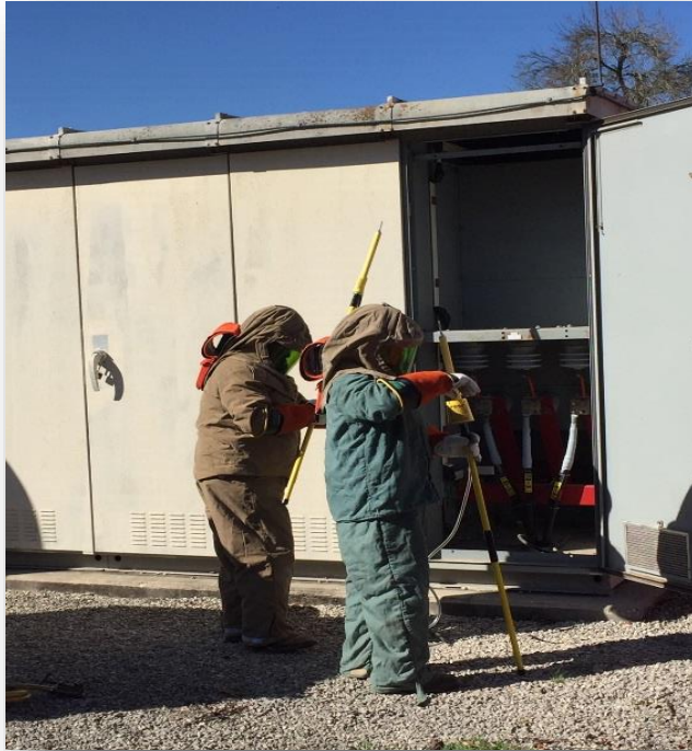
Confirming Switchgear De-energized Before Inspection, JBSA Randolph