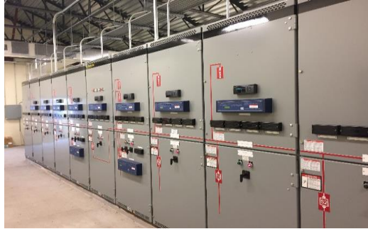
East Switching Station, JBSA Randolph