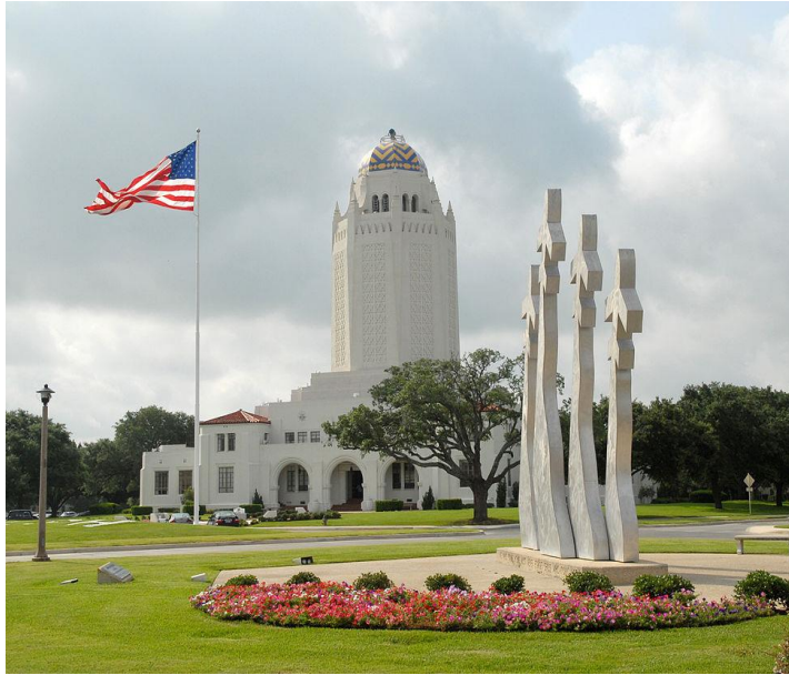
12th Flying Training Wing HQ, JBSA Randolph