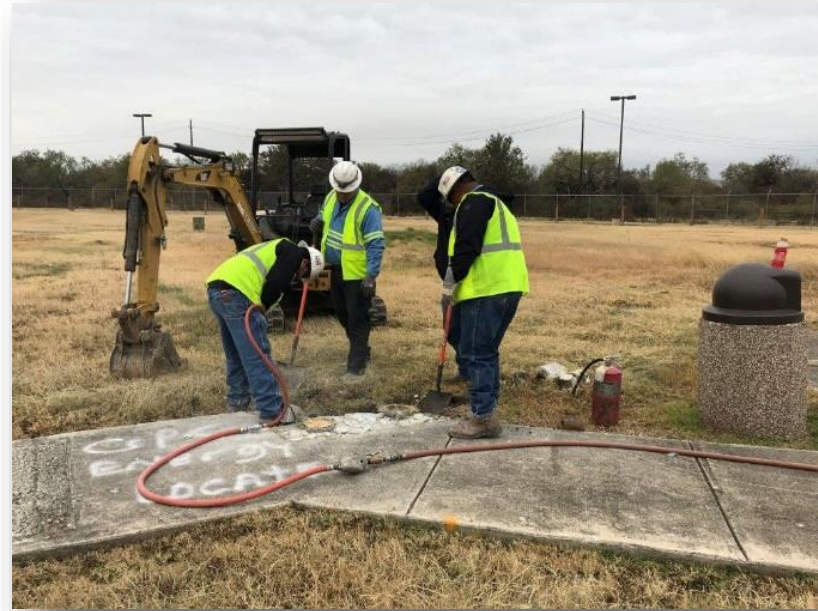
Gas System Inspection Preparation, JBSA Lackland Training Annex