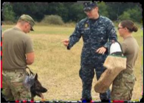
Military Working Dog Kennel, JBSA Lackland Training Annex