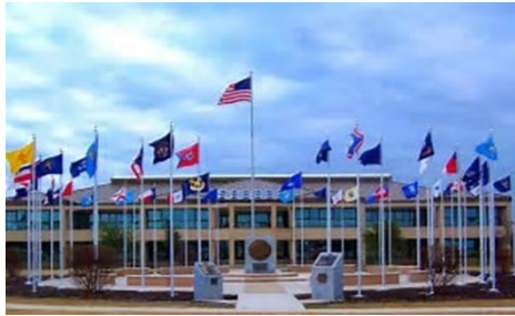
37 th Training Wing HQ, JBSA Lackland