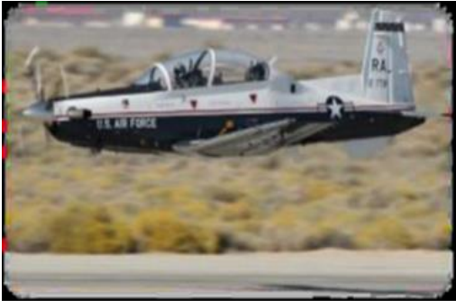
T-6 Texan Trainer Aircraft, JBSA Randolph