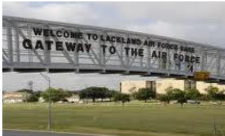
Military Dr Pedestrian Bridge, JBSA Lackland