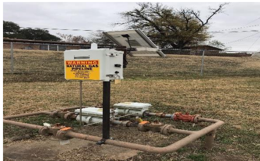
Pressure Monitor Installation, JBSA Lackland TA