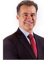
HD 119 Rep. Roland Gutierrez