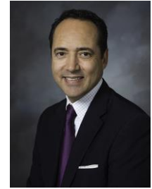
SD 26 Sen. José Menéndez