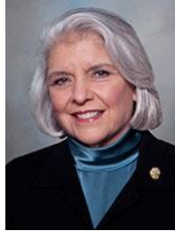
SD 21 Sen. Judith Zaffirini