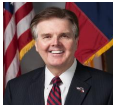
Lt. Governor Dan Patrick