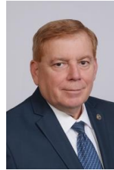
HD 118 Rep. Leo Pacheco