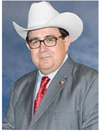
SD 19 Sen. Pete Flores