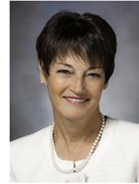
SD 25 Sen. Donna Campbell