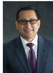
HD 123 Rep. Diego Bernal