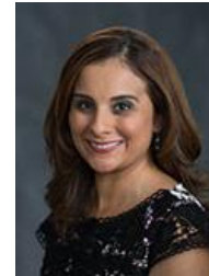
HD 124 Rep. Ina Minjarez