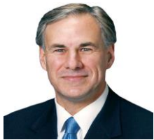
Governor Greg Abbott