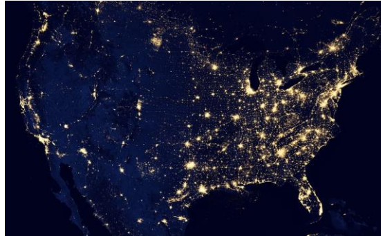
Liberty Eclipse announcement from www.securityaffairs.co