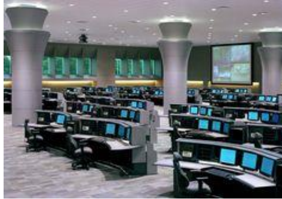
Houston Emergency Center